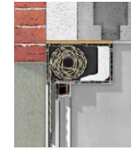
A - without building in