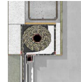
C - with complete building in